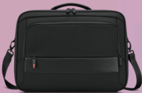
ThinkPad Professional 16-inch Topload Gen 2 4X41M69795

Please click here to view the full list of accessories.