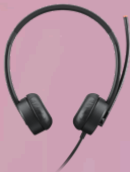
Lenovo Essential Stereo Analog Headset 4XD0K25030